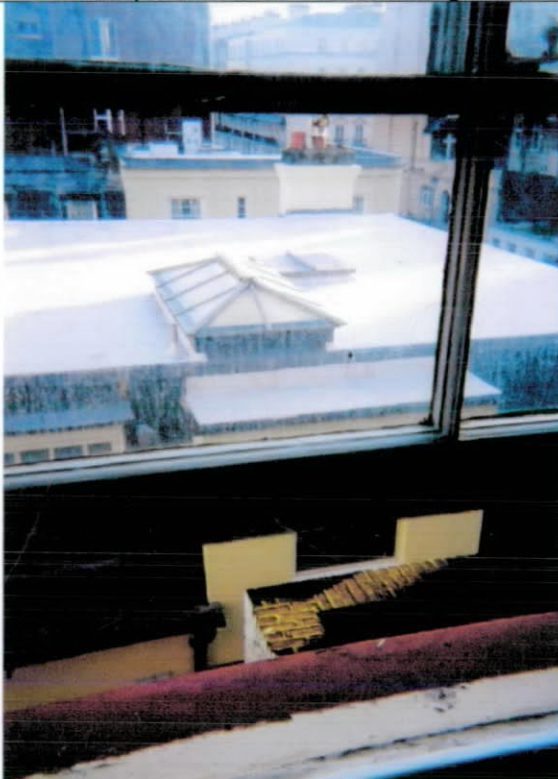
View from mezzanine end window overlooking the corner of Pavilion Road and Cadogan Gate