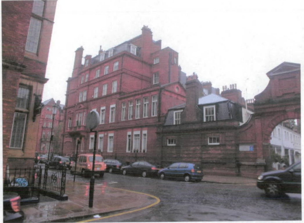
Elevation 18 Cadogan Square