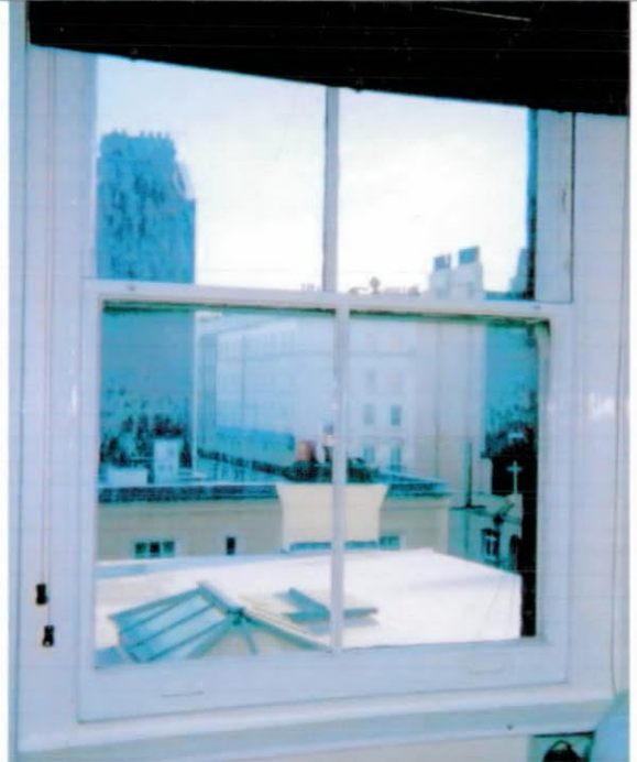
View from mezzanine end window overlooking the corner of Pavilion Road and Cadogan Gate