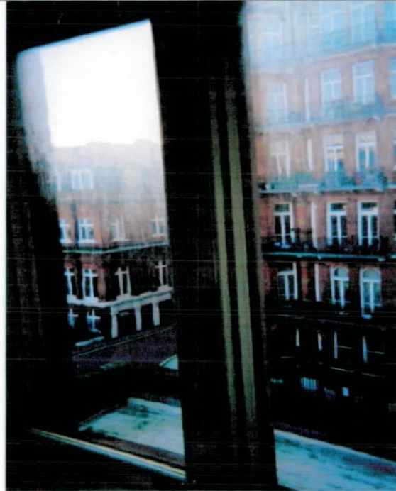
View from mezzanine side window overlooking flat roof with an aspect to Pavilion Road and Cadogan Gate