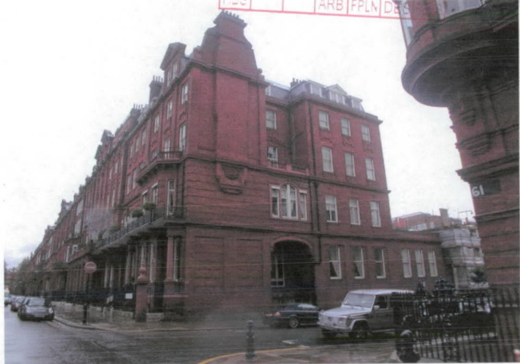
West Elevation looking East