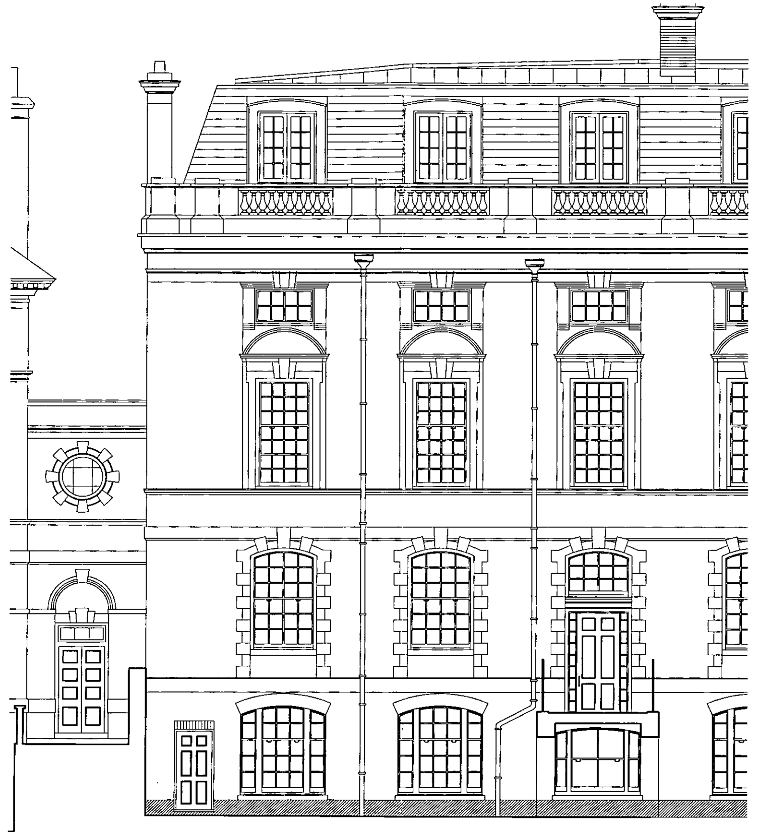
01 Proposed elevation with entrance door to match previous condition 1:100