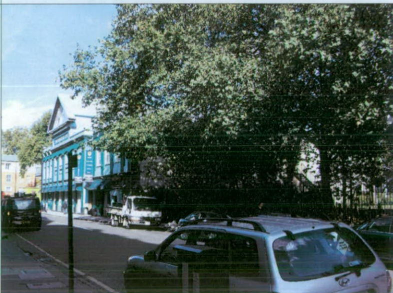
View of the Furniture Cave from Lots Road, showing part of the elevation to Westfield Park with a blank wall, October 2007