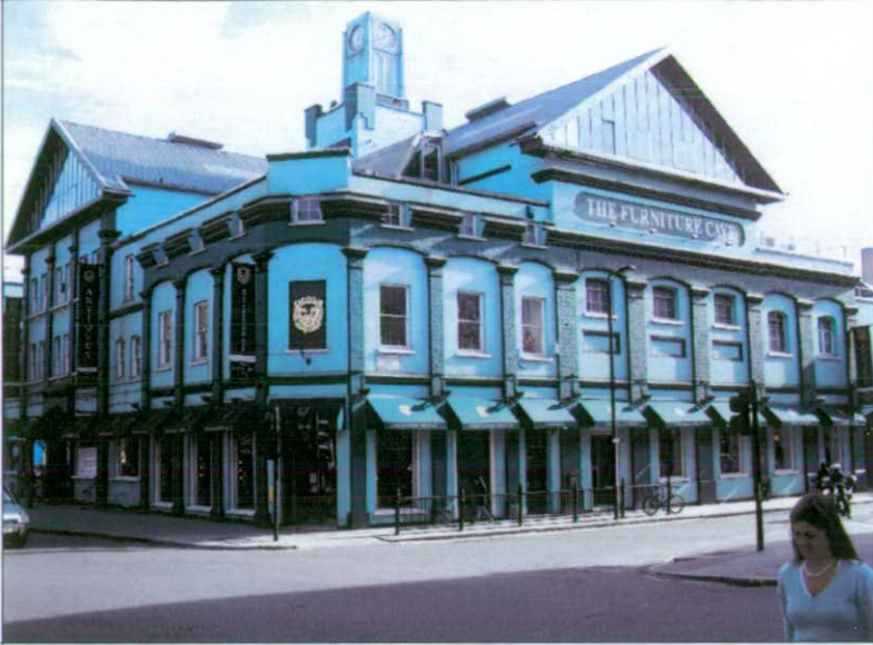
View of the Furniture Cave from Kings Road, October 2007

THE FURNITURE CAVE, 533 KINGS ROAD, LONDON SW10.