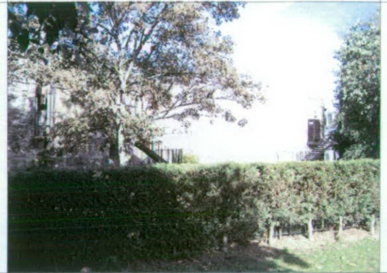
View of rear elevation of Furniture Cave from Tetcott Road, February 2008