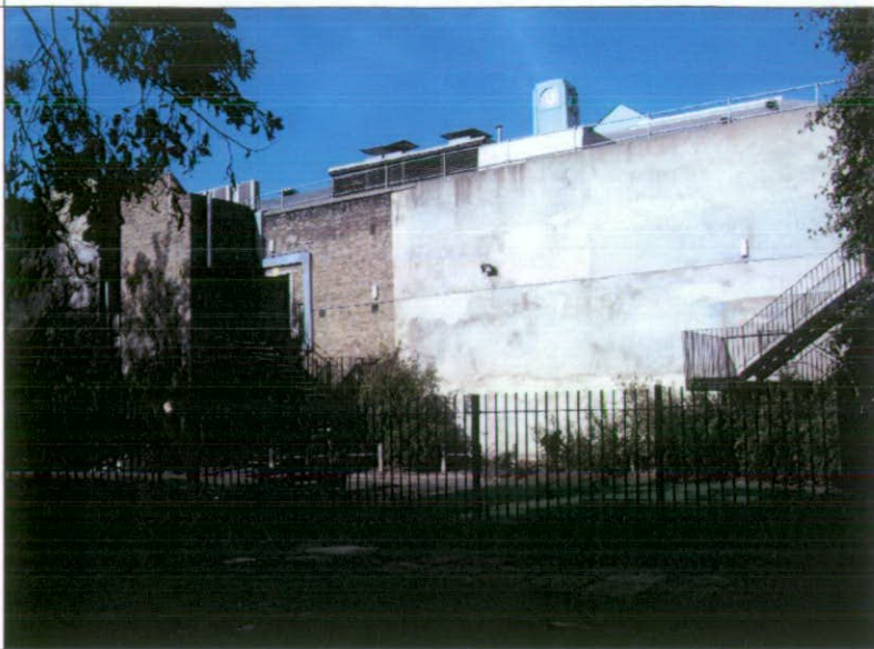
View of rear elevation of Furniture Cave from Westfield Park, February 2008

THE FURNITURE CAVE, 533 KINGS ROAD, LONDON SW10.