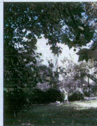
View of rear elevation of the Furniture Cave from Westfield Park, October 2007