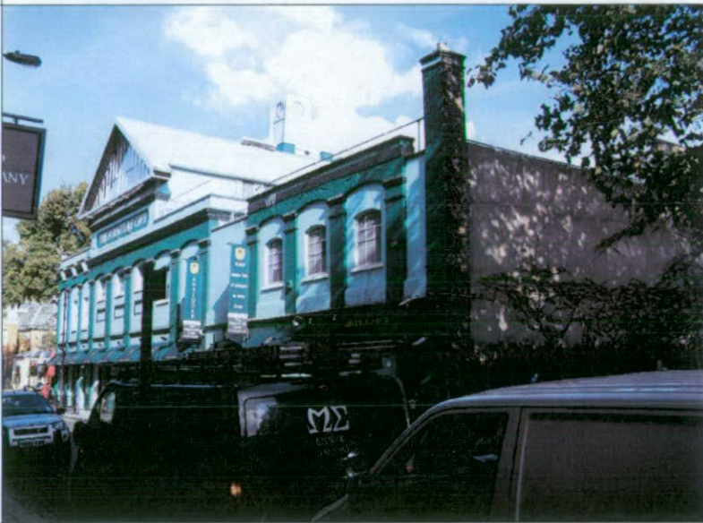
View of the Furniture Cave from Lots Road, showing part of the elevation to Westfield Park with a blank wall, October 2007