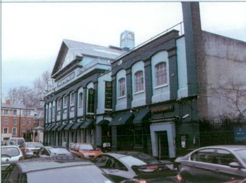
View of rear elevation of Furniture Cave from Westfield Park, February 2008