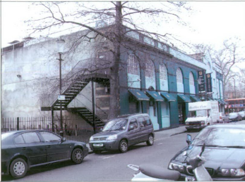
View of rear elevation of Furniture Cave from Westfield Park, February 2008

THE FURNITURE CAVE, 533 KINGS ROAD, LONDON SW10.