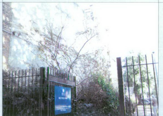
View of entrance to Westfield Park from Lots Road, October 2007