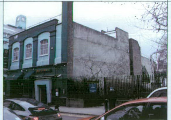
View of rear elevation of Furniture Cave from Tetcott Road, February 2008