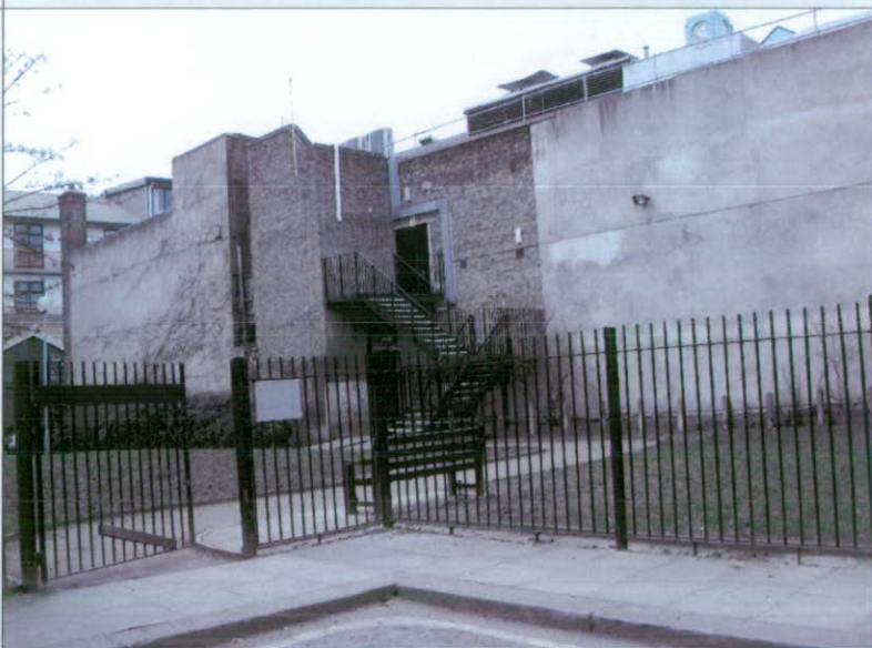
View of rear elevation of Furniture Cave from Tetcott Road, February 2008