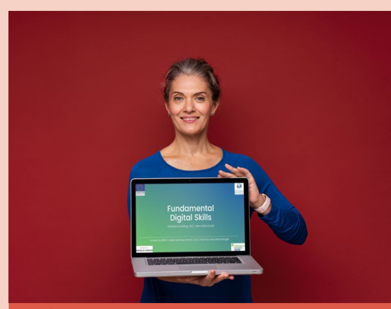
To find out more, visit www.pbc.co.uk/workshops-and-events

North Kensington residents can give their business an edge thanks to a new three-day webinar from Portobello Business Centre. The Fundamental Business Skills session will take place on Thursday 7, Friday 8 and Saturday 9 July and will help you master digital skills to improve your business' online presence.