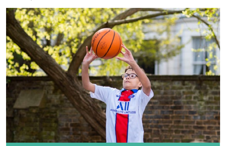
Visit https://ourcity.org.uk to see everything that's on offer and start planning your summer.

group but there's plenty of room for all young people to get involved and activities to meet the needs of those with special educational needs and disabilities too.