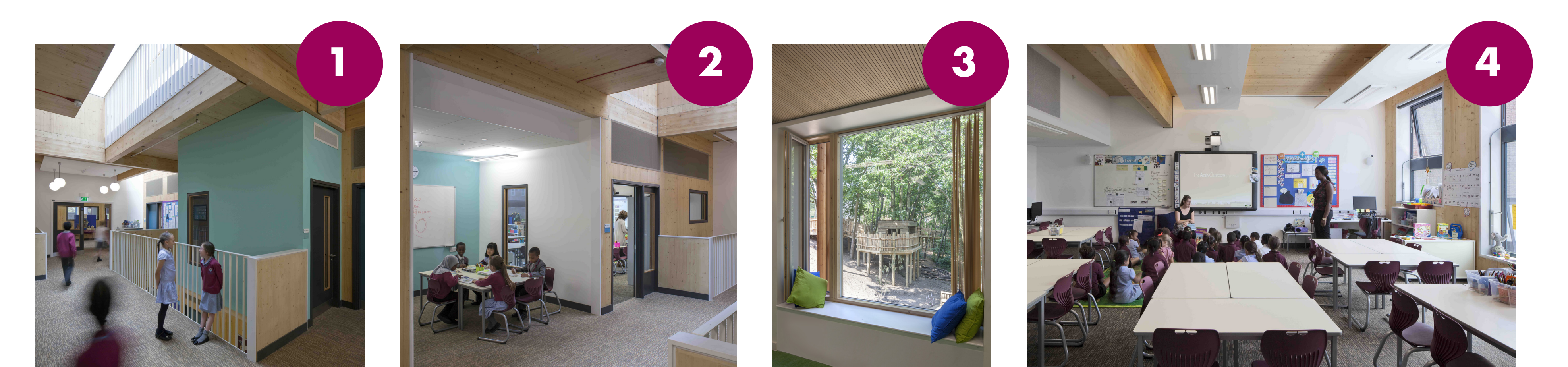
Enclosed group room and daylit circulation area with lightwell at Ark Brunel Primary School. Architect: Penoyre & Prasad