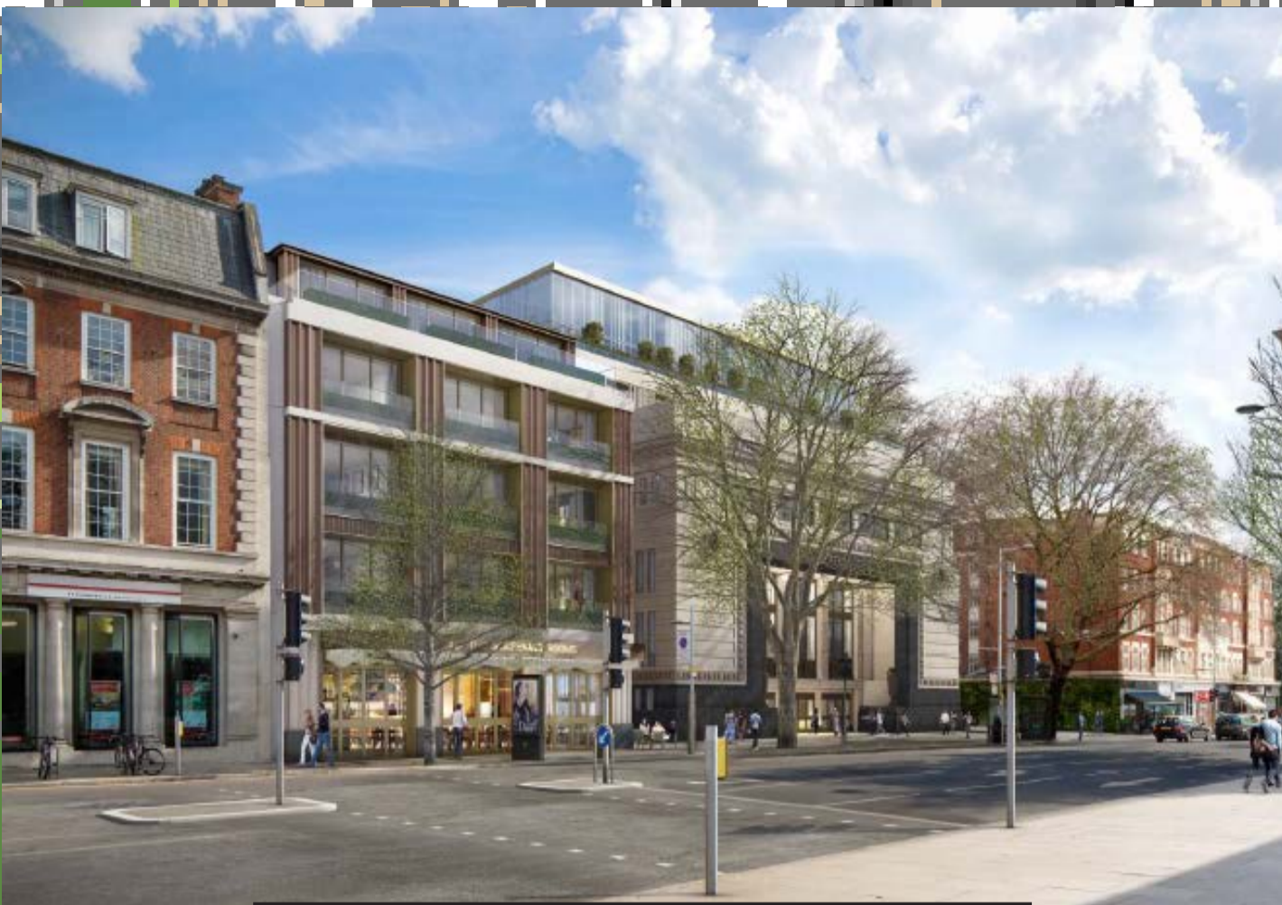
A NEW CINEMA