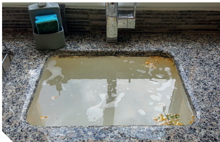
plate scrapings of fatty food can be put in your food waste caddy.

If you receive a food waste recycling collection, small amounts of cooking oil, fats,