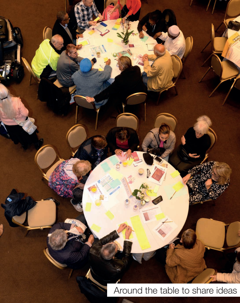
Around the table to share ideas

The continued commitment to supporting residents in north Kensington affected most acutely by the Grenfell tragedy was also highlighted.