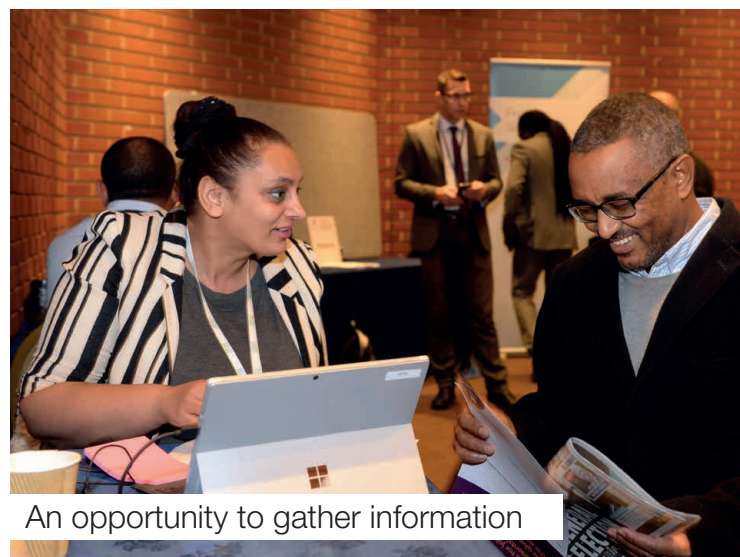
An opportunity to gather information