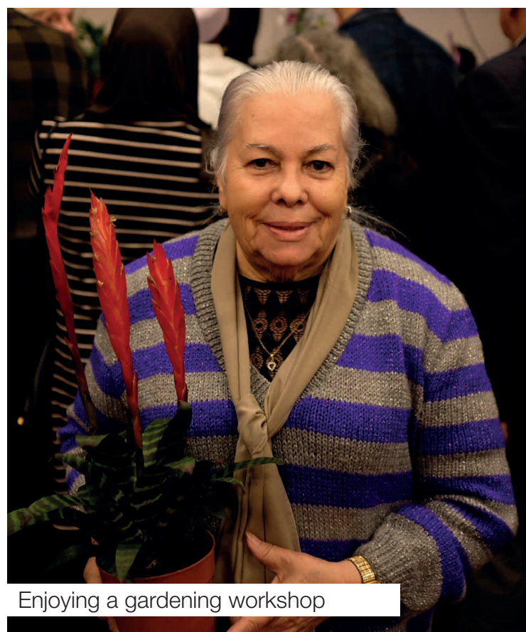
Enjoying a gardening workshop