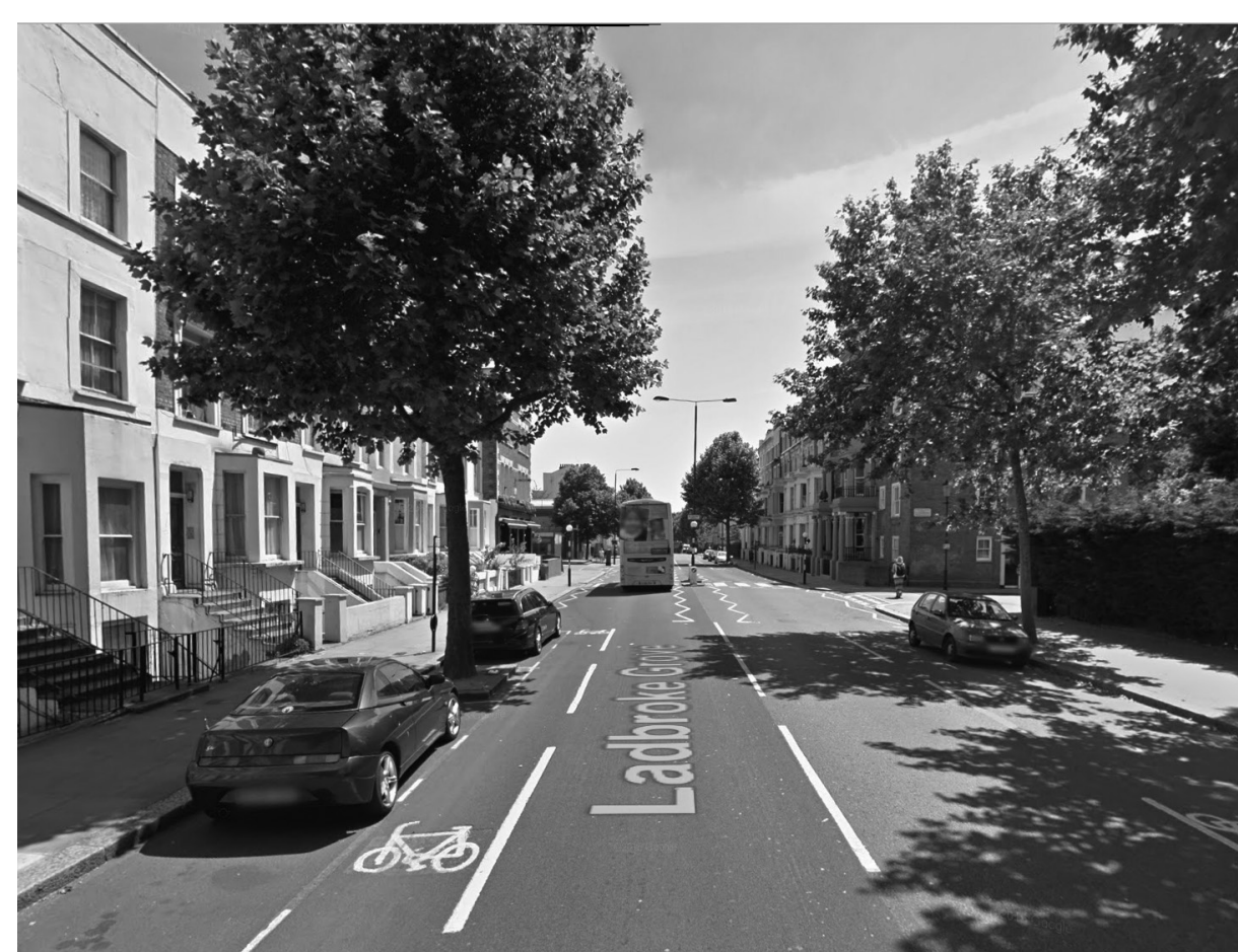
Ladbroke Grove looking south