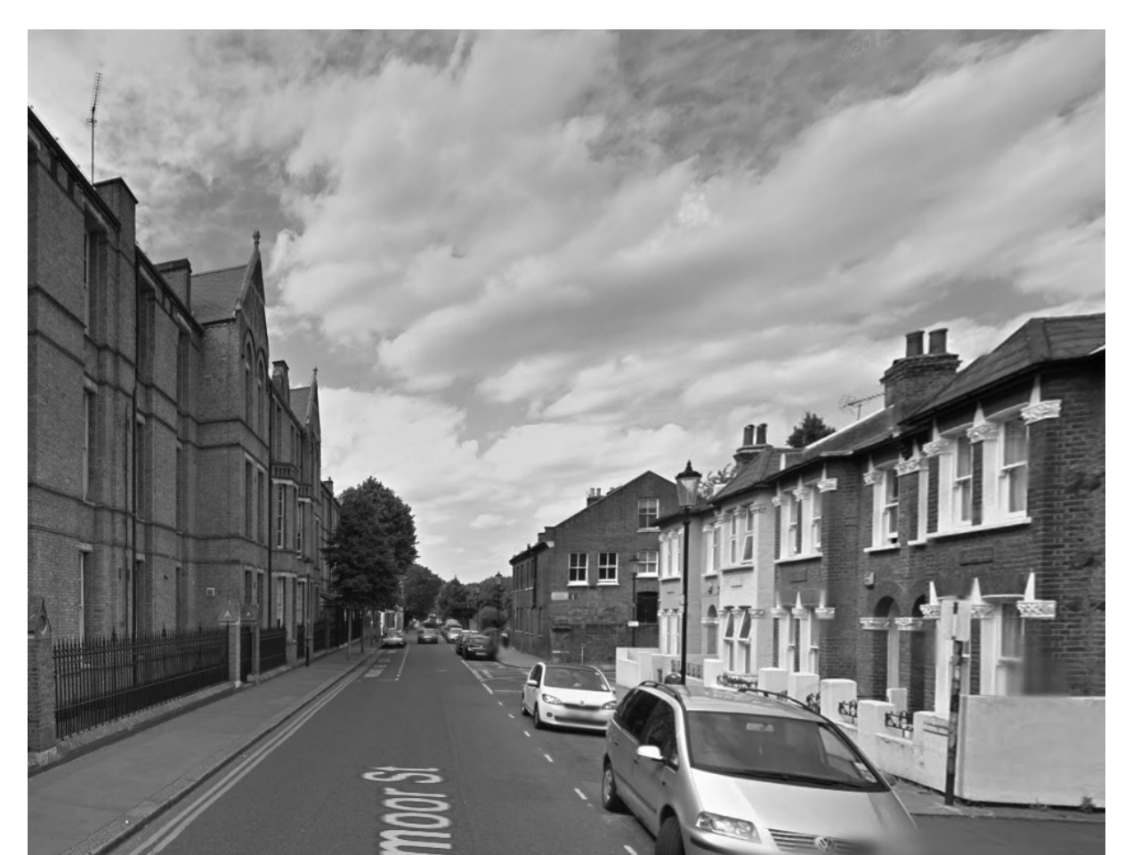
Exmoor Street looking north