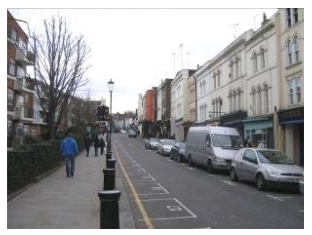
The Portobello Court Estate's frontage onto Portobello Road creates a visual break in the continuity of the retail centre on the east side, which detracts from the character and enclosure of Portobello Road.

5.5 The physical potential for extending the retail frontages as part of a major redevelopment of Portobello Court appears to be good. The site has a prominent frontage on to Portobello Road which has a good footfall. The area is situated in a good position between Westbourne Grove District Centre and Portobello Road, which would help encourage linkages between the two centres. The site is relatively large and has the potential to accommodate both small and large retail units, including smaller units that would be in keeping with the District Centre's existing units.