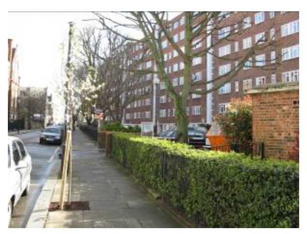
The Estate's frontages on to Westbourne Grove and Lonsdale Road have poor relationships with the roads and no active frontages. Redevelopment could provide active frontages.