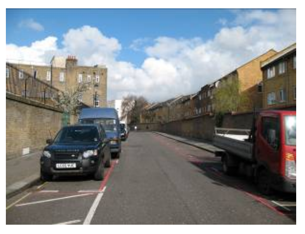
To the north of Portobello Road Special District Centre the road has no active frontages and there are significant challenges to overcome to extend the Centre northwards.

5.9 We do not believe an extension of Portobello Road to the north of Golborne Road is viable or appropriate given the distance from the prime shopping area. The scale of development required to extend active frontages on both sides of Portobello Road beyond Golborne Road would need to exceed 3,000 sq m gross, and up to 15,000 sq