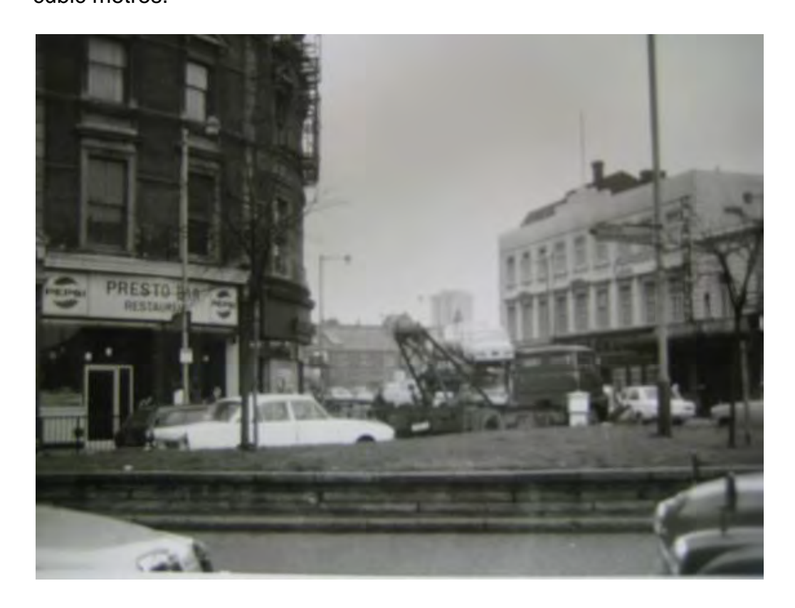
Fig 2. – Same lime tree in 1978. Height: 6 metres approx.