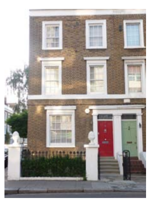
14 St. Ann's Road