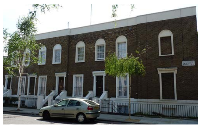
111-117 Wilsham Street

The boundaries of the conservation area were extended to include all the wedge of land between Norland and Ladbroke (mainly the north end of Portland Road), plus an area around Clarendon Cross, the shops fronting Holland Park Avenue to the south of the extended area and the Royal Crescent Mews/Norland Road area. These extended boundaries were adopted by the Council on 26th April, 1978. The complete list was published in the London Gazette on 2nd June, 1978. On 25th June, 1979 the Secretary of State of the Department of Environment accepted that the extended Norland Conservation Area is of "outstanding historic and architectural interest".