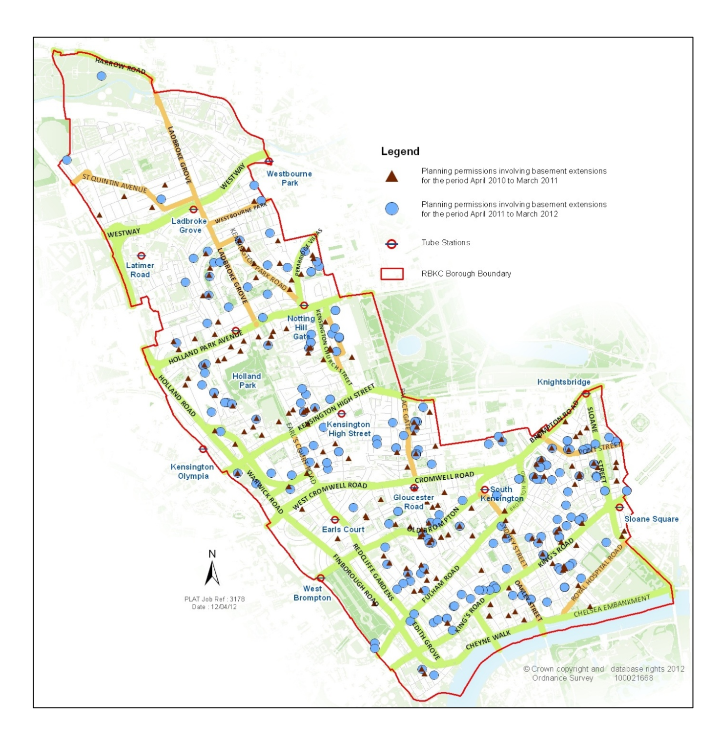
Figure 3: Planning permissions granted for development including a basement extension 2010 and 2011