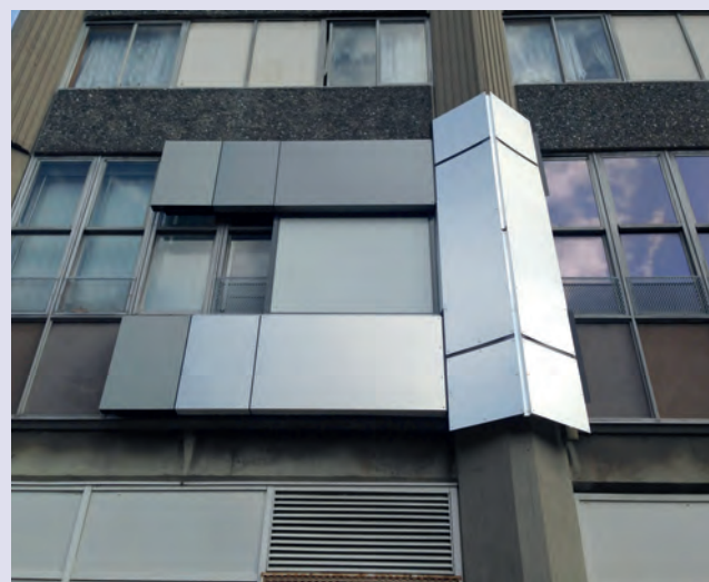
A section of the new cladding on Grenfell Tower

The Royal Borough is funding the work as part of the wider regeneration of the area, which will see it transformed by autumn 2015.