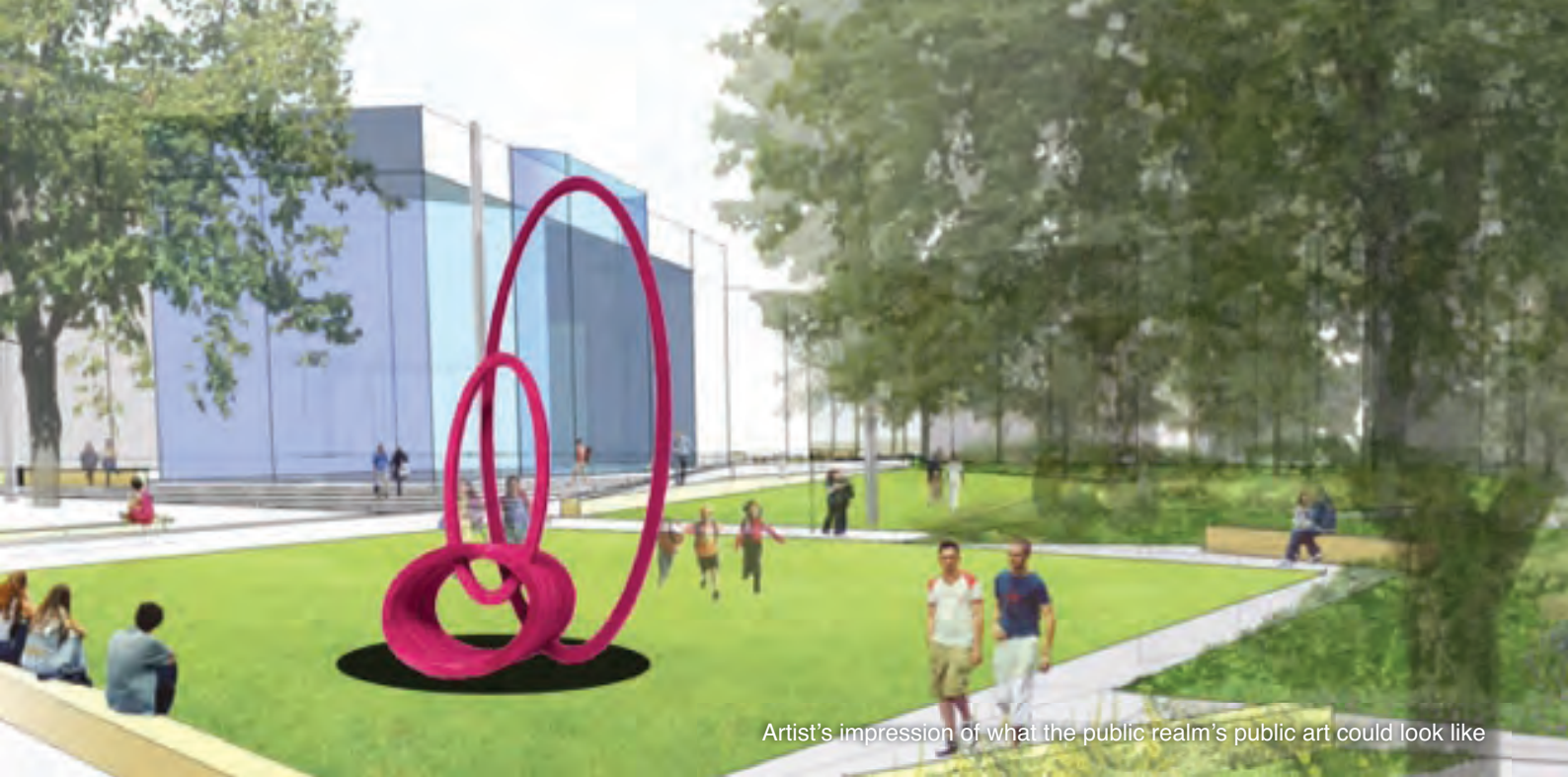
Artist's impression of what the public realm's public art could look like