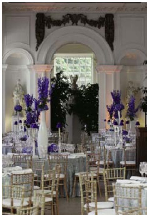
The Orangery at Kensington Palace