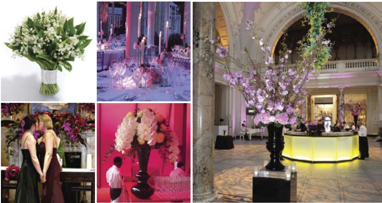
Lavender Green Flowers