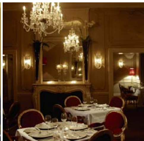
The Cadogan Hotel