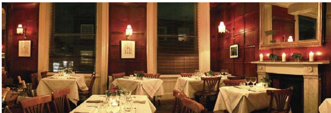
The Pig's Ear, flowers by Amanda Austin Flowers