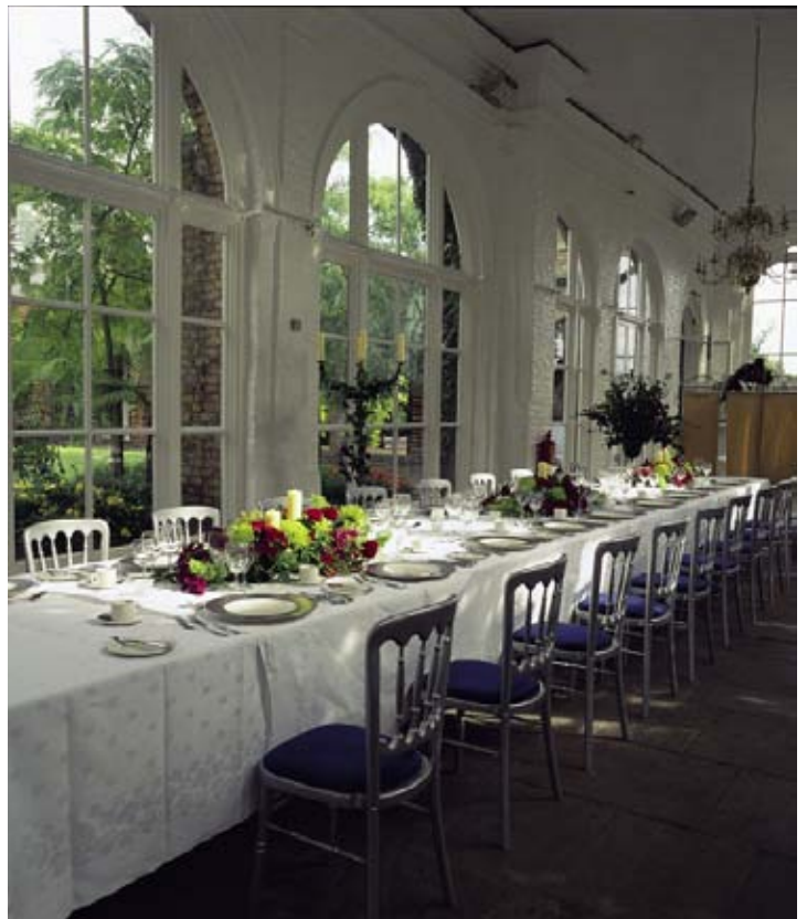
The Orangery Gallery