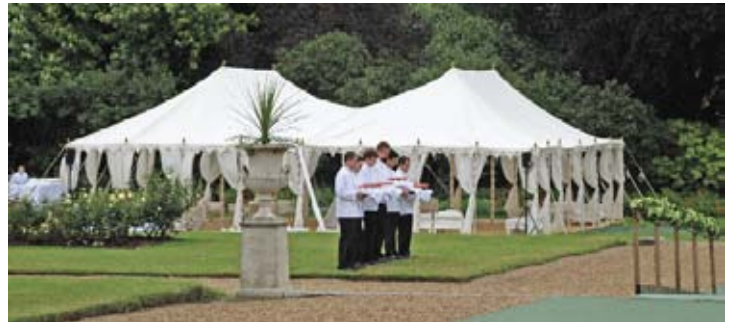
The Private Garden