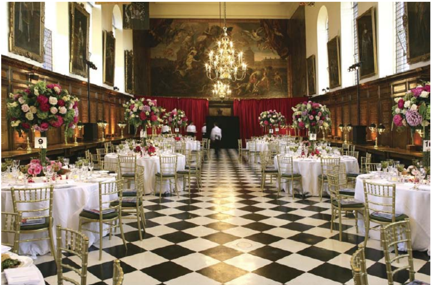
The Great Hall