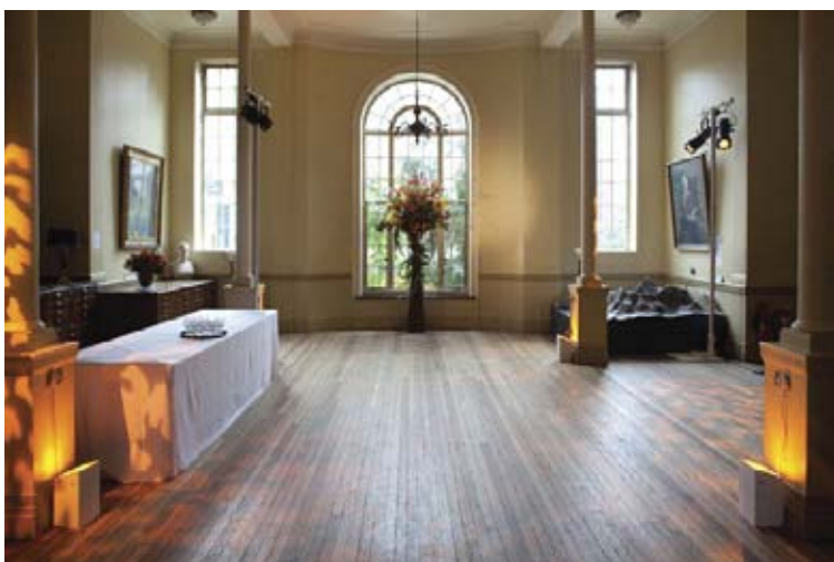
The Map Room