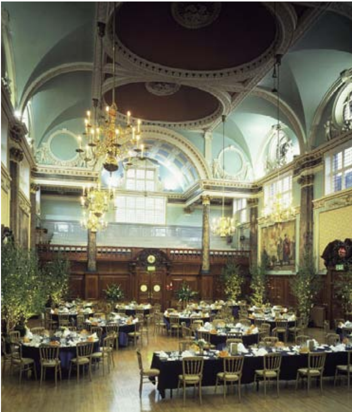
Chelsea Old Town Hall