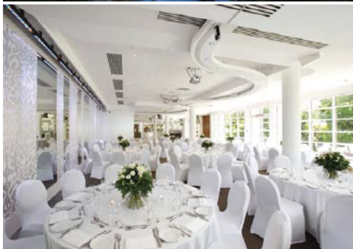
The Roof Gardens