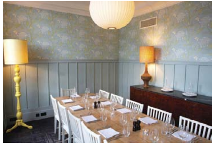
High Road House

Daphne's Conservatory, 112 Draycott Avenue, London SW3 3AE. Tel: 020 7589 4257 Email: reservations@daphnes-restaurant.co.uk Web: www.daphnes-restaurant.co.uk