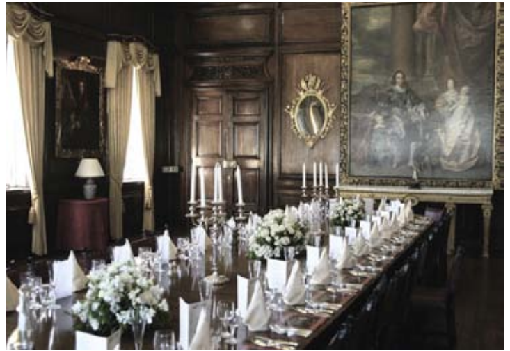
The Council Chamber

The Events Department Royal Hospital Chelsea Royal Hospital Road SW3 4SR. Tel: 020 7881 5298 Email: eventsao@chelsea-pensioners.org.uk Web: www.chelsea-pensioners.co.uk