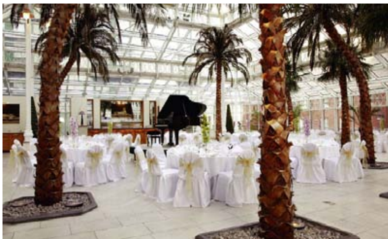
Millennium Gloucester Hotel

Millennium Gloucester Hotel 4 – 18 Harrington Gardens, London SW7 4LH Tel: 020 7331 6257 Fax: 020 7331 6466 Email: mcc.events@millenniumhotels.co.uk Web: www.millenniumhotels.co.uk/millenniumgloucester