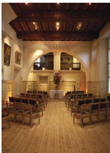
The Royal Geographical Society's Hall