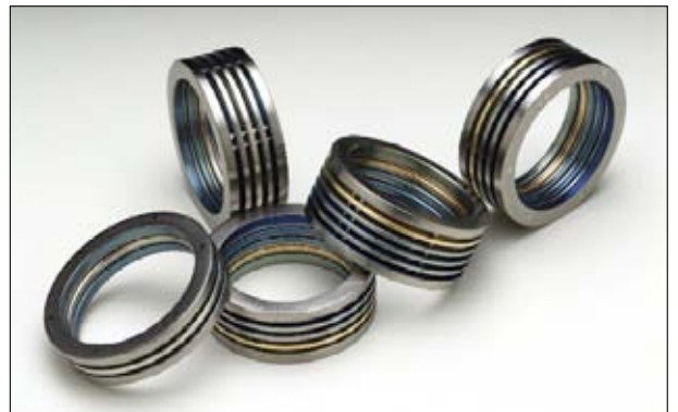
Lesley Craze Gallery