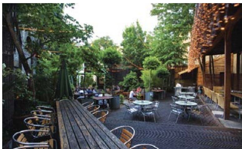
The Garden Bar and Grill

The Garden Bar and Grill 41 Bramley Road, London W10 6SZ Tel: 020 7229 1111 Email: gardenbar@housebars.co.uk Web: www.housebars.co.uk/gardenbar