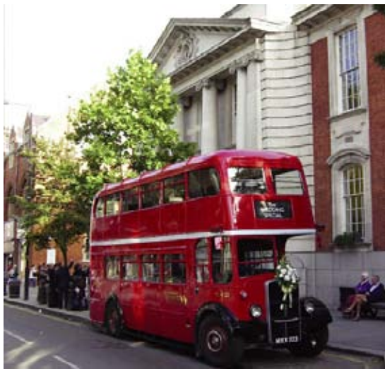
Timebus 'Regent Low Height' outside Chelsea Old Town Hall

Lavender Green Flowers Tel: 020 7127 5303 Email: sue@lavendergreen.co.uk Web: www.lavendergreen.co.uk