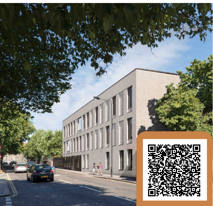
Scan the QR code for more info and an explanatory video.

The Council is updating its website on a regular basis throughout the audit process, and will include details of products, what we plan to do about it, and what safety advice we have received.